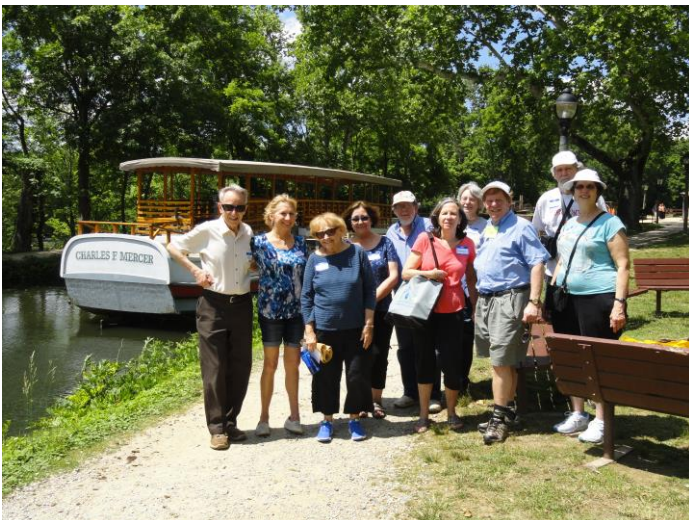
VoK Canal Trip-ers post-cruise, boat in background

locks. This excursion was planned very professionally!