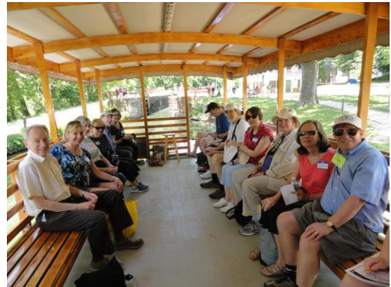
VoK Canal Trip-ers get best seats on the boat!